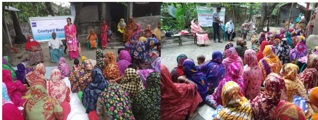
CTWF members are attending Courtyard Meeting

Then facilitator emphasized on the issue of prevention early marriage, and discussed child marriage and GBV violence is increased during the COVID_19 situation and it has a direct link with human trafficking. So, we have to be conscious about the age of marriage for boy 21 and girl 18 years.