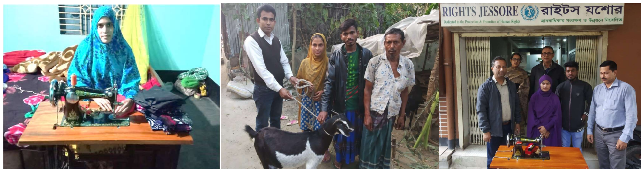
Survivors are receiving livelihood support from Rights Jessore

The objective of this livelihood activities was to support repatriate survivors for ensuring their economic and social stability continuing during staying at their home and gradually improving their social well-being.