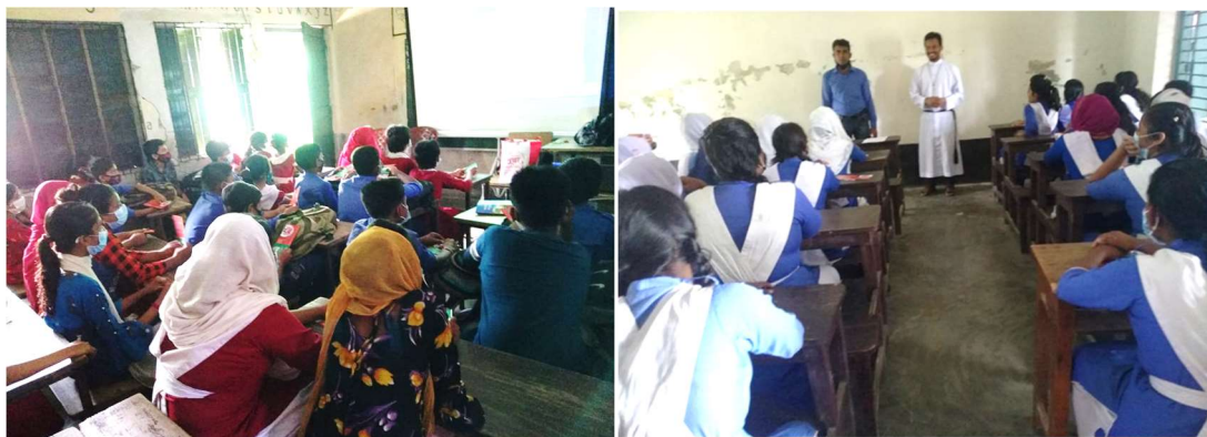
Students are attending School Orientation Session

The discussion was initiate by RJ staff in the presence of students and teachers and COIVD_19 issue and it protective measures was first priority in the discussion. A common realization was that protection and prevention both are important for human trafficking and if students are aware about the issue than it will be much easier for reducing human trafficking from the society. Students are aware about Human trafficking law 2012 and its punishment of sex trafficking and labor trafficking under this law.