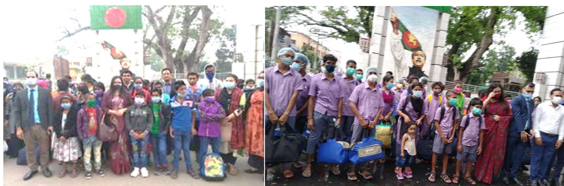
Rights Jessore received repatriate survivors from Benapol boarder

The COVID-19 situation brings the problem on repatriation which has faced by the project during this year. In the time of increasing delta variant of Corona virus in India, the government of Bangladesh has suddenly imposed 14 days' mandatory institutional quarantine for every returnee at hotels/boarding in their own expenses. As most of victim are vulnerable so they are unable to provide this quarantine support. On the other hand, the organization has no extra budget to meet this quarantine support. That time we approach our well-wishers to held regarding this support. Then current donor of this project provided assurance to quarantine support and it was done subsequently. So, during that time was difficult for this project.