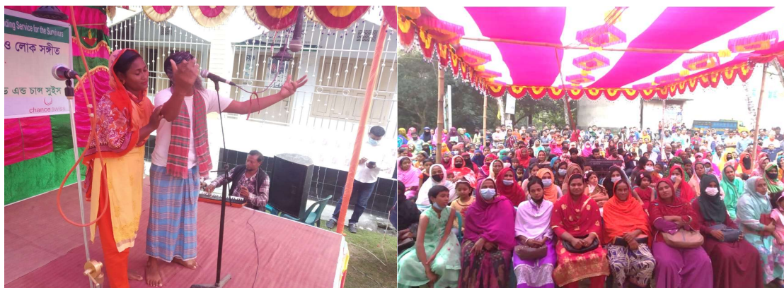
Community people are enjoying street drama and folk song

This year the project has conducted two street drama along with folk song at two districts like Jhenaidha and Jassore. In Jhenaidha, the street drama was organized at PaglaKani Union under Jhenaidha Sadar thana with the present of Upazila Chairman of Jhenaidha Sadar Upazila as Chief guest. The Social welfare officer, Head teacher of Paglakanai High School, representatives of Paglakanai welfare trust and community leaders of respective unions along with local people, women, children were attended the program. Almost 200+ people were gathering in the event and pleasantry observed the program. The Upazila Chairman of Jhenaidha Sadar told that in his speech that he will provide support to continue this type of event at their area to prevent human trafficking and empower women and girls to reduce human trafficking from the society.