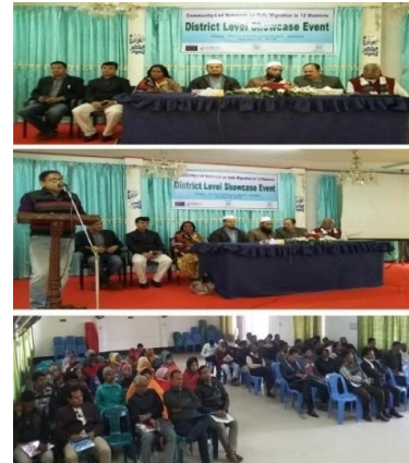
22.01.18_ District Level Showcase Event CCTS (Conference Room) Sadar, Jessore

Results 942 community people were sensitized on the issue of prevention human trafficking and unsafe migration.