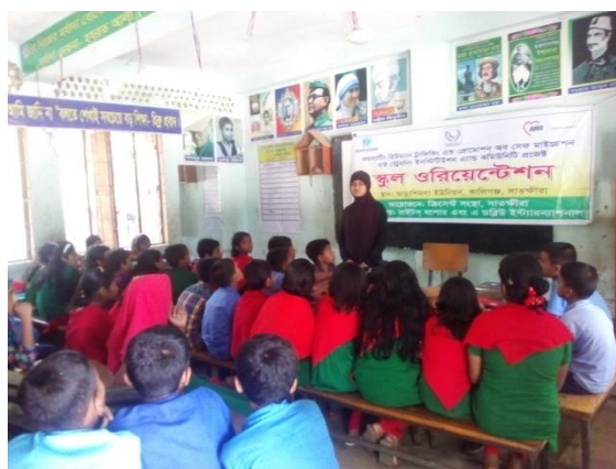
A School Orientation Session is being conducted by CVG Member at Varasimla Union of Satkhira district.

Objective: Children's vulnerability to human trafficking has been reduced