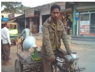
27.01.18_Miking in the community Misridiara, Magura, Bohirampur Magura Union, Jhikargacha, Jessore