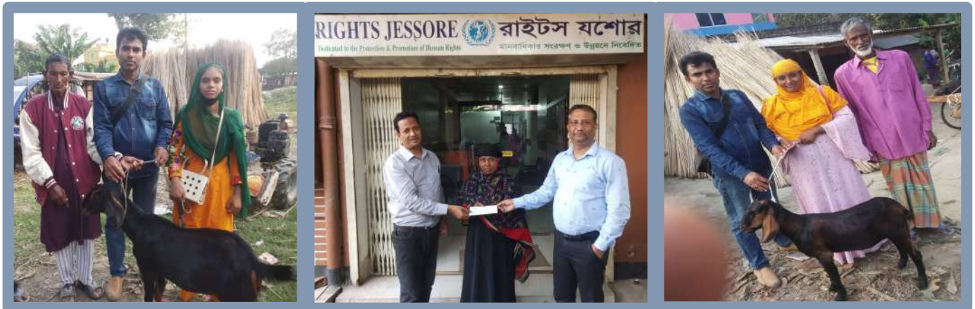
Survivors Received Livelihood Support

The objective of this livelihood activities was to support repatriate survivors for ensuring their economic and social stability continuing during staying at their home and gradually improving their social well-being. The project provided livelihood support like purchased sewing machine and purchased goat for rearing. The support was selected according to their experience, opportunity and resources, project staff directly involved during purchase and handover the materials.