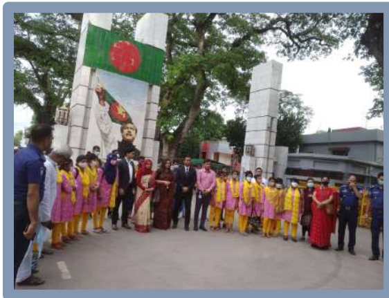
RJ received repatriated survivors & ED of RJ speaking with media