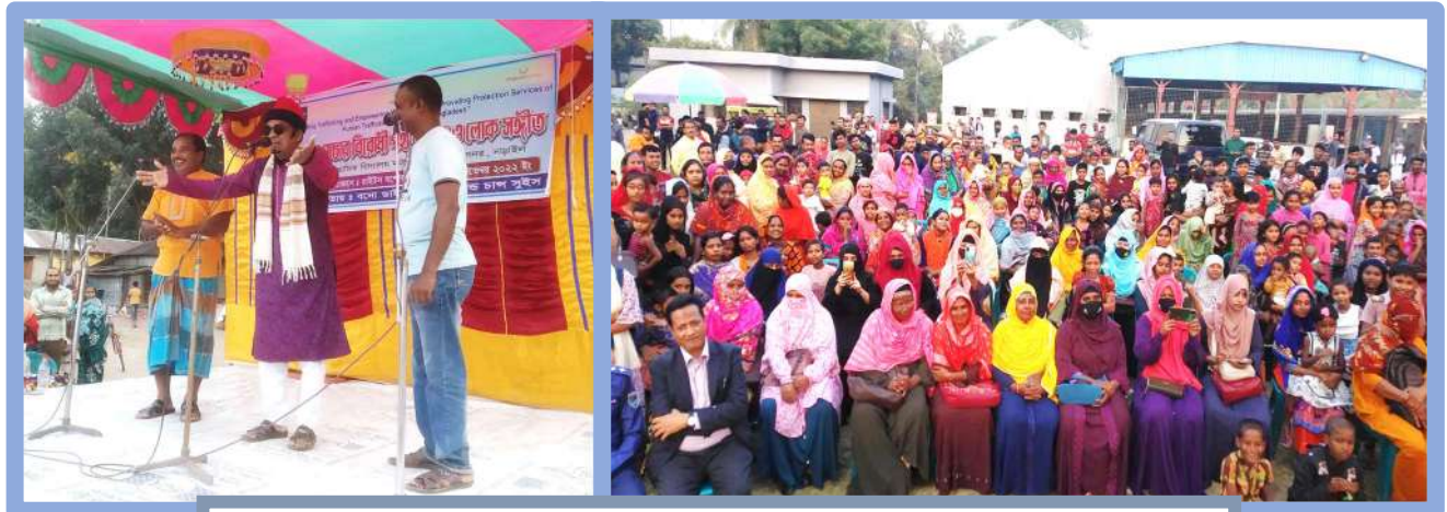
Community people are enjoying street drama and folk song

The purpose of this event was to visually observe how trafficking happened and what are the main characteristics of trafficking at rural level. The people understand the element of trafficking and inspired to remove the traffickers from their area to control human trafficking and violence against women and girls.